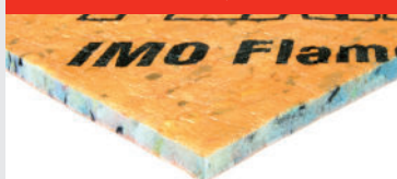
Flamecheck 4, 6 & 8 mm

To ensure safety on ships, the United Nations has established the International Maritime Organization (IMO). This organization ensure that safety and environmental requirements on board ships are complied with.